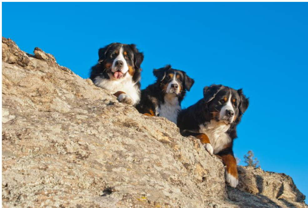
Watson, Legend and Smokey striking a pose for the 2012 Berners of the West calendar!