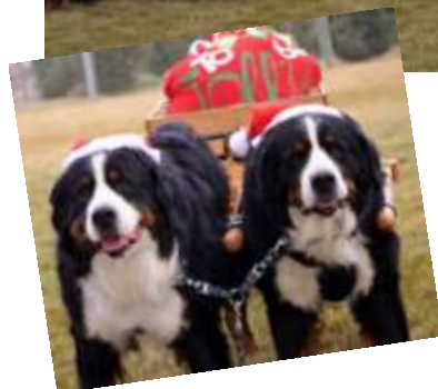
Berner Noel Aspen Grove