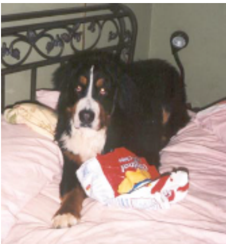
Where's the dip?