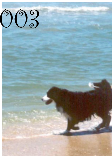
Lathi... A true Bernese Beach Dog