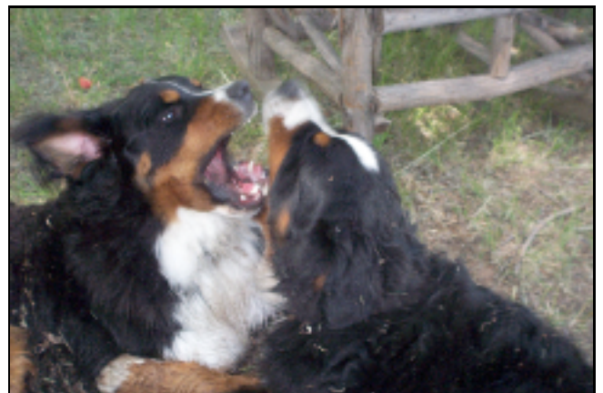
A spirited game of "mouth"