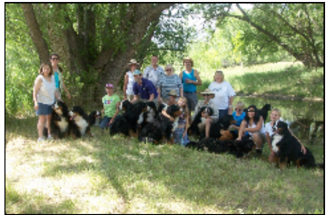
Hail, hail the gangs all here