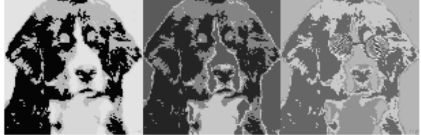
He got hair down to his hocks Got to be a winner he just do what he please

Here come old flattopline, he come trotting up showy. He got almond eyeball, he one study berner