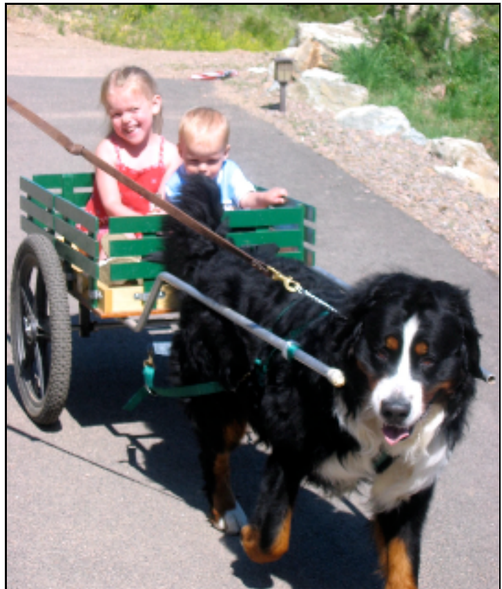
Gandalf giving a ride to some happy fans.

If you are interested in donating a trophy contact Dottie Schulte at dotties911@aol.com