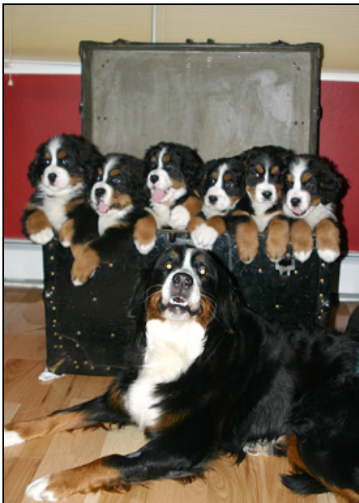
Ch. Marben's Tuckernuck Belle with her new puppies.

When should I consider chiropractic care for my animal?