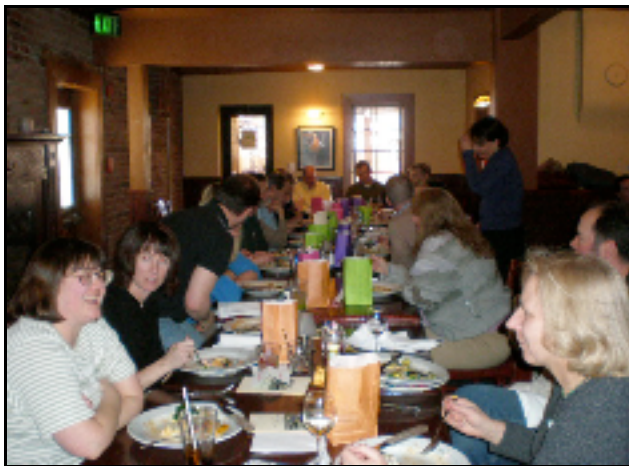
BMDCR members enjoy human companionship as they celebrate the successes of their dogs in 2007.