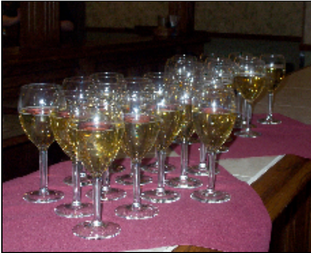
Just sitting and waiting to toast the accomplishments of our dogs