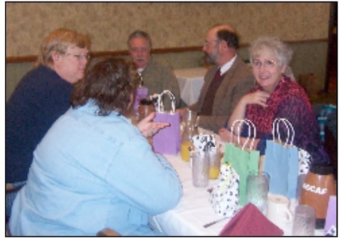
Socializing with fellow Berner lovers.