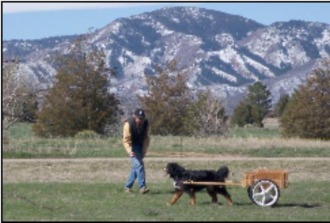
Bob realigning Bogo into a pulling position