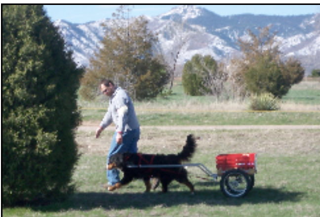
Barry and Legend show the teamwork it takes to earn a passing performance