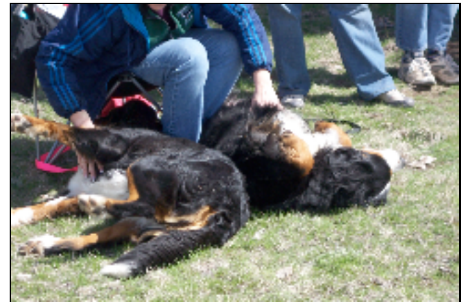
Canine spectators demonstrating additional working abilities of the Bernese Mountain Dog—rolling over for belly rubs.