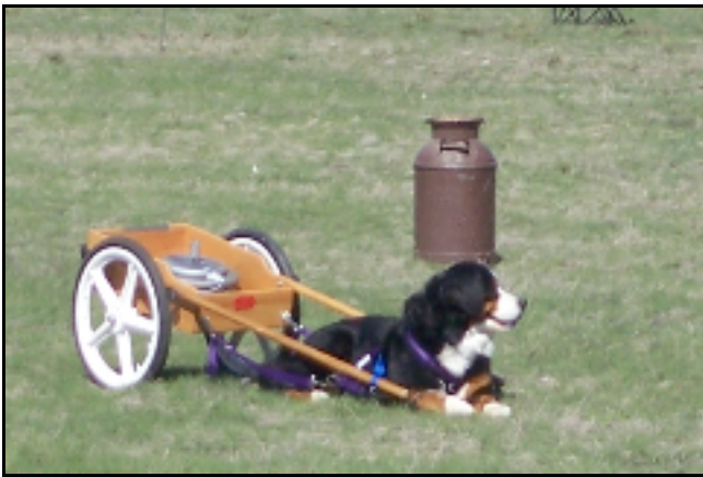
Chimo patiently waiting for mom Jeanne to return