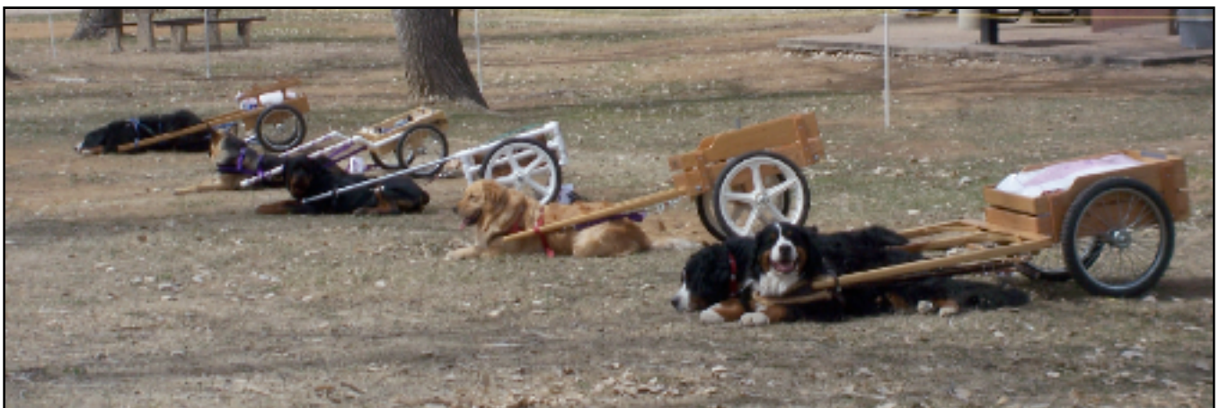
An equal opportunity draft test--Rotties, German Sheperd Dogs, Sammies and Golden Retrievers competed.