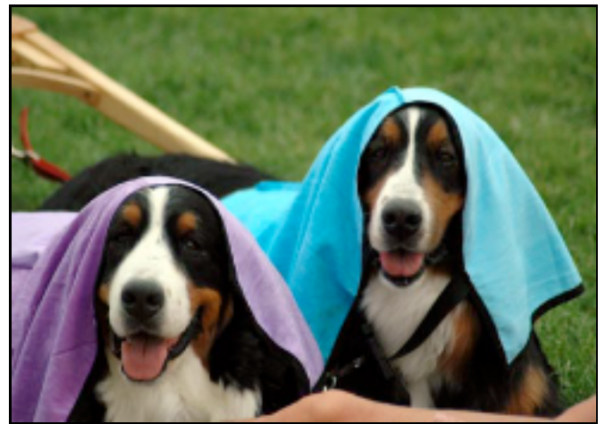
Keeping cool on a hot day.