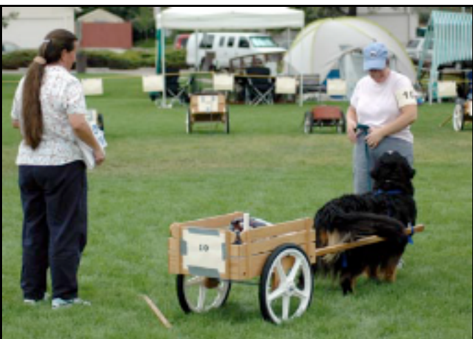
Mom, the ruler is crooked!