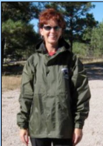
Val waiting for rain in a olive green slicker

Come help us make room for new items. Prices slashed! Lots of great items for holiday gifts!