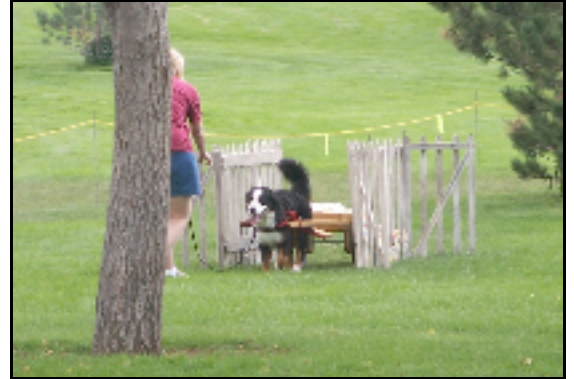
Questa and Elaine safely maneuver the narrows while on their way to a passing score