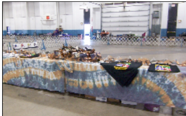
The trophy table looked spectacular thanks to Sara Karl and Sherri Mangin