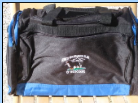
Gear bag with logo