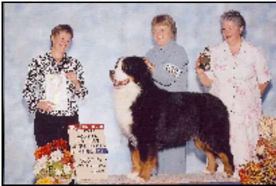
Best in Veterans Sweepstakes CH Gweebarra Full Throttle owned by Dawn Letry