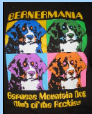
Bernermania logo on shirts, blankets and bags