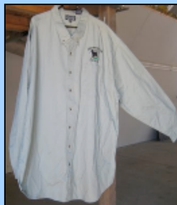
Long sleeve oxford has been a popular item (in green & blue)