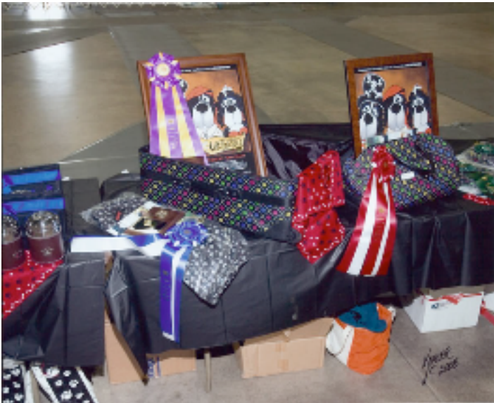
Trophy table expertly set up by Sara Karl.