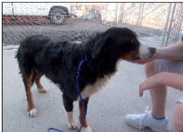
Meeting Hudson at the shelter.