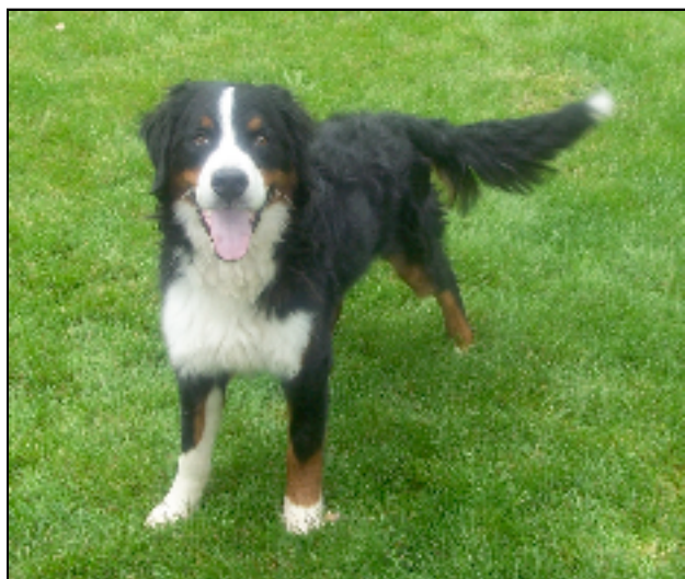
Hudson on day 4 after some antibiotics and TLC.