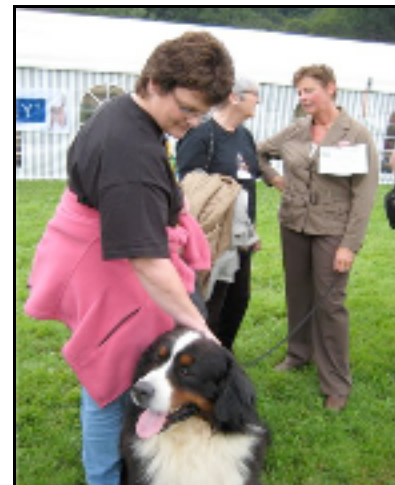
Sandy wishing for a comb and some grooming scissors