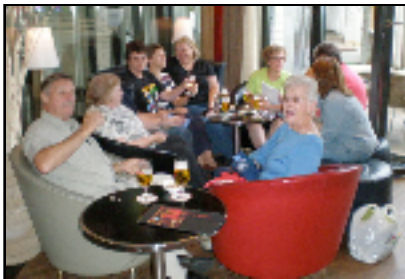
BMDCR members toast to the heritage of our dogs

During the following two days attendees were treated to a traditional style European conformation show, viewing over 400 Bernese from Switzerland, the Netherlands, Belgium, France, Germany, Russia and Scandinavia. The backdrop of the Alps and the Burgdorf castle provided a spectacular setting. Saturday evening Bernese lovers from all over the world honored our past and present dogs at the Jubilee dinner featuring Swiss cuisine and plenty of local wines. Dinner was preceded by a concert of Alphorns, traditional Swiss flag throwing and music by the Swiss club chorale. Everyone left with lasting memories of lovely dogs, Swiss hospitality and the camaraderie of fellow Bernese Mountain Dog owners.