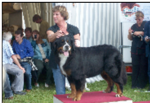
Best of Show for both Saturday and Sunday and Best in Jubilee Berntiers Front Page