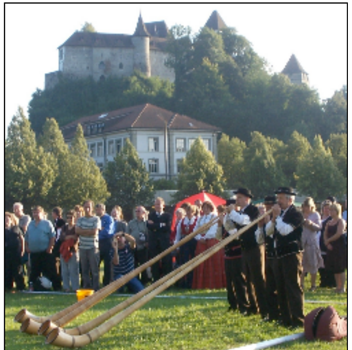
Alphorns play in the shadow of the Burgdorf castle