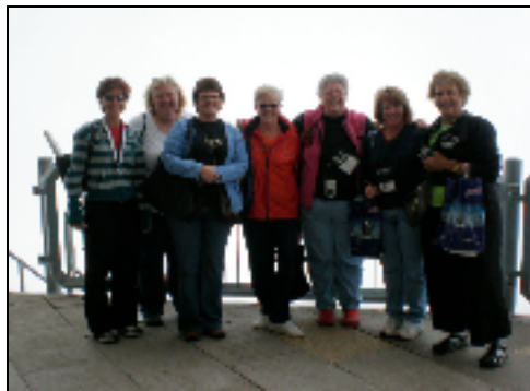
BMDCR members on top of the Swiss world