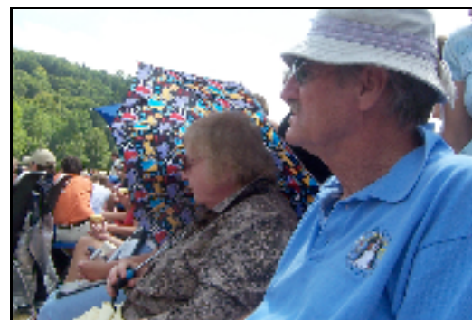
The Tuckers intent on analyzing the European BMDs