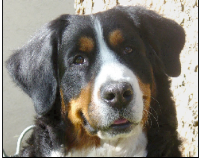
Wagontale's Lilla Labolina RN June 21, 2003 - August 10, 2007