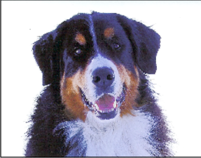
Pinnacle's Dulcimer Dance CD, DD, CGC August 11, 1995 - July 30, 2007

Our hearts ache from the loss of our sweet special Dulcie, but we have many wonderful memories to cherish. Thanks, Dulcie for giving us 12 (almost) great years.