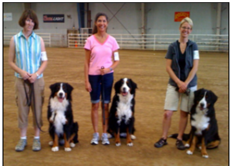
Dash, Murrey and Fisher earning their Canine Good Citizenships. A nice group effort!