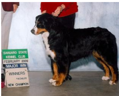
CH Sandpiper A Sunnyday Wagontale OA AXJ (Sunny)