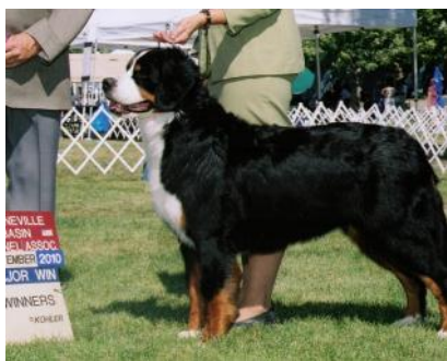
CH Brisago Aurora Borealis at Wagontale (Rory)