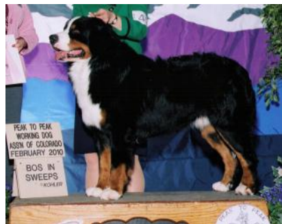
CH Brisago A Bright Night at Wagontale (Tycho)